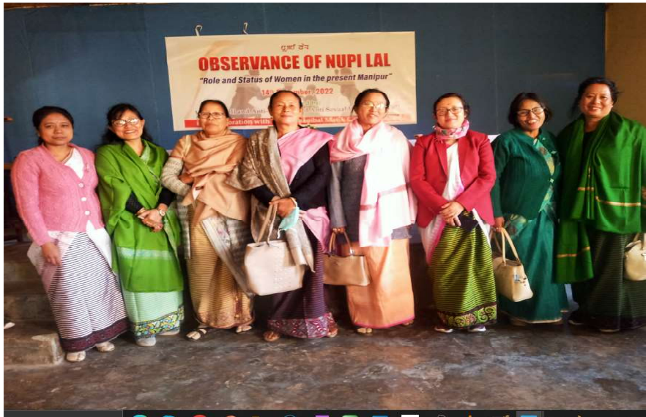
Members , Women Cell, Thambal Marik College, Oinam